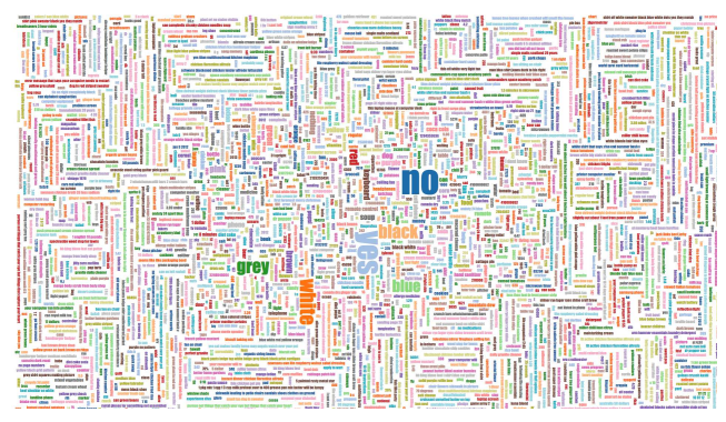
Figure 4. Popularity of answers in VizWiz, with the text size proportional to the number of times the answer occurs.

answers "Unanswerable" and "Unsuitable Image". This visually highlights the fact that there are a large number of unique answers; i.e., \sim 58,789. While in absolute terms this number is an order of magnitude smaller than existing larger-scale datasets such as VQA 2.0 [8], we find the answer overlap with existing datasets can be low. For example, only 824 out of the top 3,000 answers in VizWiz are included in the top 3,000 answers in VQA 2.0 [8]. This observation is used in the next section to explain why existing prediction systems perform poorly on the VizWiz dataset.