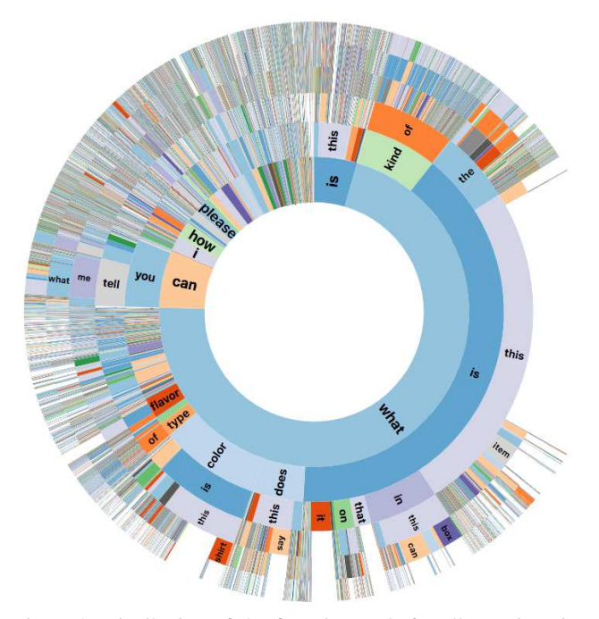
Figure 2. Distribution of the first six words for all questions in VizWiz. The innermost ring represents the first word and each subsequent ring represents a subsequent word. The arc size is proportional to the number of questions with that word/phrase.

because people offer auxiliary information to disambiguate the desired response; e.g., "Which one of these two bags would be appropriate for a gift? The small one or the tall one? Thank you." Longer questions also can arise when the audio recording device captures too much content or background audio content; e.g., "I want to know what this is. I'm have trouble stopping the recordings."