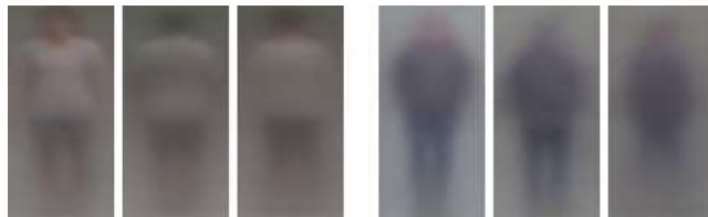
Figure 3. Mean images of Market-1501 (left) and Duke (right) test sets using predictions of the PSE model’s view predictor. The images show front, back and side view from left to right.

View-predictor performance: The performance of the trained ResNet-50 view predictor on the annotated test set of RAP dataset is 82.2%, 86.9% and 81.9% on front, back, and side views, respectively. In order to illustrate its performance on our target re-id dataset we display mean images in Figure 3. These are obtained by averaging all images, on the test set of the target dataset, which are classified as front, left, or side. This visualization gives an impression of the view prediction accuracy on the target re-id data in the absence of annotated view labels. In the frontal mean image