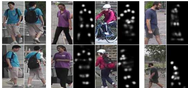
Figure 1. Camera view and body pose can significantly alter the visual appearance of a person. A different view might show different aspects of the clothing (e.g. a backpack) while an altered pose may lead to body parts (e.g. arms or legs) being located at different positions of the image. Pose information can also help guide the attention of a re-id approach in case of mis-aligned detections.

Person re-identification (re-id) in non-overlapping camera views poses a difficult matching problem. Most previous solutions try to learn the global appearance of a persons using Convolutional Neural Networks (CNNs) by either applying a straightforward classification loss or using a metric learning loss. To better learn local statistics, the same has been applied to image regions, e.g. by using horizontal stripes or grids [19, 4]. Because of the inherent challenge of matching between different views and poses of a person,