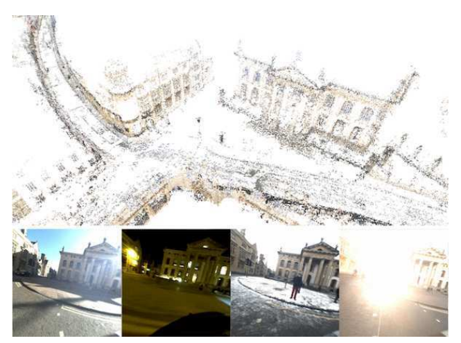
Figure 1. Visual localization in changing urban conditions. We present three new datasets, Aachen Day-Night, RobotCar Seasons (shown) and CMU Seasons for evaluating 6DOF localization against a prior 3D map (top) using registered query images taken from a wide variety of conditions (bottom), including day-night variation, weather, and seasonal changes over long periods of time.

50,65,73], reducing memory requirements [12,33,50], and more flexible scene representations [54]. All these methods utilize local features to establish 2D-3D matches. These correspondences are in turn used to estimate the camera pose. This data association stage is critical as pose estimation fails without sufficiently many correct matches. There is a well-known trade-off between discriminative power and invariance for local descriptors. Thus, existing localization approaches will only find enough matches if both the query images and the images used to construct the 3D scene model are taken under similar viewing conditions.