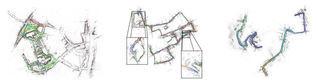
Figure 3. 3D models of the Aachen Day-Night (left, showing database (red), day-time query (green), and night-time query images (blue)), RobotCar Seasons (middle), and CMU Seasons (right) datasets. For RobotCar and CMU, the colors encode the individual submaps.

Ground truth poses for the queries. Due to GPS drift, the INS poses cannot be directly used as ground truth. Again, there are not enough feature matches between day- and night-time images for SfM. We thus used the LIDAR scanners mounted to the vehicle to build local 3D point clouds for each of the 49 submaps under each condition. These models were then aligned to the LIDAR point clouds of the reference trajectory using ICP [5]. Many alignments needed to be manually adjusted to account for changes in scene structure over time (often due to building construction and road layout changes). The final median RMS errors between aligned point clouds was under 0.10m in translation and 0.5^{\circ} in rotation across all locations. The alignments provided ground truth poses for the query images.