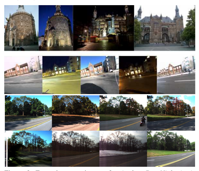
Figure 2. Example query images for Aachen Day-Night (top), RobotCar Seasons (middle) and CMU Seasons datasets (bottom).

Table 2. Detailed statistics for the three benchmark datasets proposed in this paper. For each dataset, a reference 3D model was constructed using images taken under the same reference condition, e.g. , "overcast" for the RobotCar Seasons dataset.