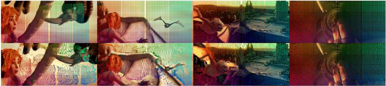
Figure 4: Four visual examples on the MPI-Sintel test partition, which exhibit large motions and occlusion areas. From top to bottom : the source images with the initial grid of points overlaid and the target images with the corresponding matches as found by our fully trained network. Colors are unique and they encode correspondences. Even for fast moving objects, points tend to track the surface correctly, without sliding – see e.g. the dragon’s wing, claw, and the flying monster.