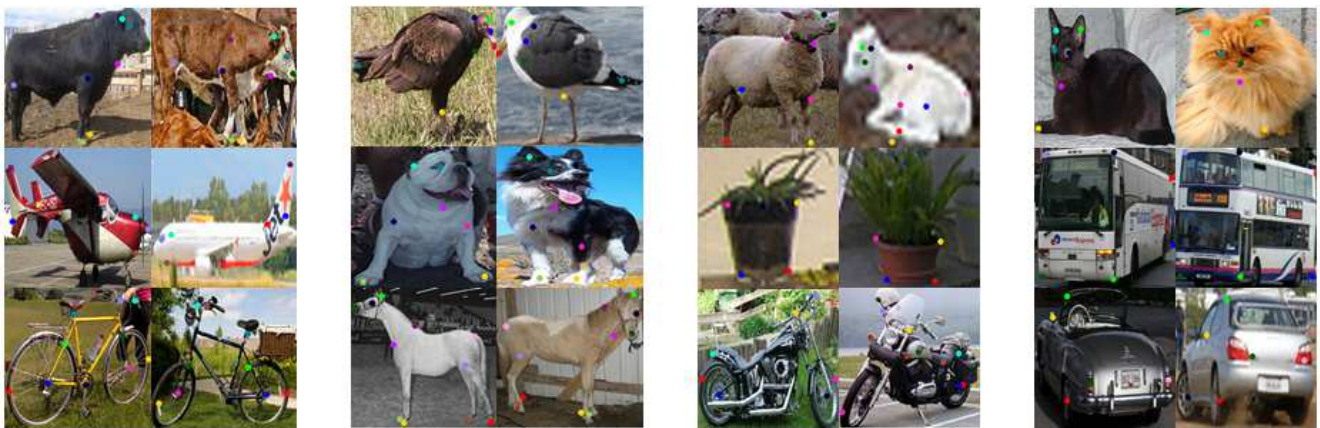
Figure 6: Twelve qualitative examples of our best performing network GMNwVGG-T on the PASCAL VOC test-set. For every pair of examples, the left shows the source image and the right the target. Colors identify the computed assignments between points. The method finds matches even under extreme appearance and pose changes.

surpass nearest neighbor counterparts, or approaches that use deep feature hierarchies that were not refined jointly with (and constrained by) the quadratic assignment problem.