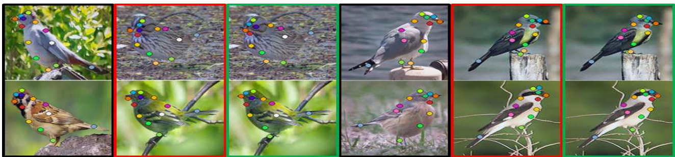
Figure 5: Four qualitative examples of our best performing network GMNwVGG-T , on the CUB-200-2011 test-set. Images with a black contour represent the source, whereas images with a red contour represent the targets. Color-coded correspondences are found by our method. The green framed images show ground-truth correspondences. The colors of the drawn circular markers uniquely identify 15 semantic keypoints.