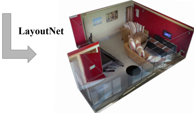
Figure 1. Illustration. Our LayoutNet predicts a non-cuboid room layout from a single panorama under equirectangular projection.

and aligns the image to be level with the floor (Sec. 3.1). This alignment ensures that wall-wall boundaries are vertical lines and substantially reduces error according to our experiments. In the second step, corner (layout junctions) and boundary probability maps are predicted directly on the image using a CNN with an encoder-decoder structure and skip connections (Sec. 3.2). Corners and boundaries each provide a complete representation of room layout. We find that jointly predicting them in a single network leads to better estimation. Finally, the 3D layout parameters are optimized to fit the predicted corners and boundaries (Sec. 3.4). The final 3D layout loss from our optimization process is difficult to back-propagate through the network, but direct regression of the 3D parameters during training serves as an effective substitute, encouraging predictions that maximize accuracy of the end result.