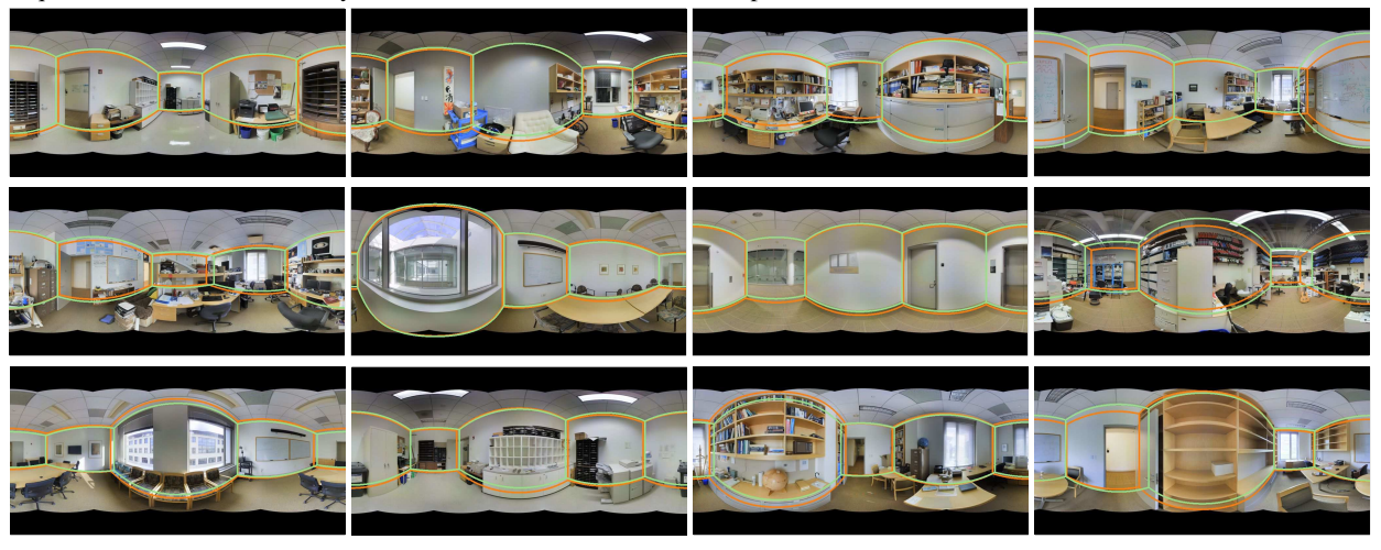
Figure 4. Qualitative results (randomly sampled) for cuboid layout prediction on the Stanford 2D-3D annotation dataset. This dataset is more challenging than the PanoContext dataset, due to a smaller vertical field of view and more occlusion. We show our method's predicted layout (orange lines) compared with the ground truth layout (green lines). Best viewed in color.

"ours (corner)"; 2) joint prediction of corner and boundary, denoted as "ours (corner+boundary)"; 3) our full approach with 3D layout loss, denoted as "ours full (corner+boundary+3D)"; 4) our full approach trained on a combined dataset; 5) our full approach without alignment step; 6) our full approach without cuboid constraint; 7) our full approach without layout optimization step; and 8) our full approach using L2 loss for boundary/corner prediction instead of cross entropy loss. Our experiments show that the full approach that incorporates all configurations performs better across all the metrics. Using cross entropy loss appears to have a better performance than using L2. Training with 3D regressor has a small impact, which is the part of the reason we do not use it for perspective images. Table 2