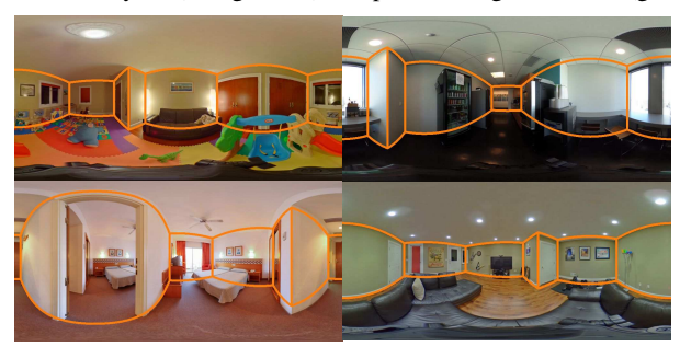
Figure 6. Qualitative results for non-cuboid layout prediction. We show our method's predicted layout (orange lines) for non-cuboid layouts such as "L"-shaped rooms. Best viewed in color.

consumption, Yang et al. report to be less than 1 minute, Pano2CAD takes 30s to process one room. One forward pass of LayoutNet takes 39ms. In CPU mode (w/o parallel for loop) using Matlab R2015a, our cuboid constraint takes 0.52s, alignment 13.73s, and layout optimization 30.5s.