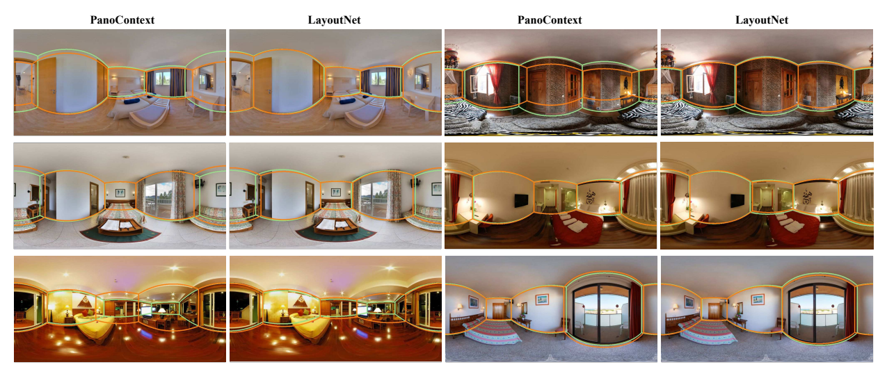
Figure 3. Qualitative results (randomly sampled) for cuboid layout prediction on PanoContext dataset [32]. We show both our method's performance (even columns) and the state-of-the-art [32] (odd columns). Each image consists predicted layout from given method (orange lines) and ground truth layout (green lines). Our method is very accurate on the pixel level, but as the IoU measure shows in our quantitative results, the 3D layout can be sensitive to even small 2D prediction errors. Best viewed in color.