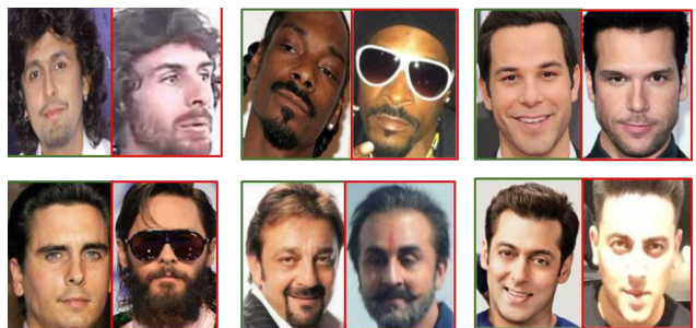
Figure 6. The Figure shows eg. of False Positives i.e. both the images in each of the six pairs are of the different identity (the one with green border is the genuine image and the one with the red border is the imposter image), but our model says that the two images are that of the same identity.

Our success cases are shown in Figure 7, in which we show both False Negatives and True Positives . The pairs highlighted in green are of the same identity, one being the genuine image and the other being the disguised image whereas the pairs in which one of the images is highlighted