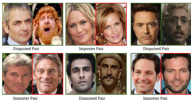
Figure 7. The Figure shows examples of False Negatives and True Positives i.e the both the images either correspond to imposter pair (the pairs with green and red borders) or disguised pair (the pairs with only green border) and our model has predicted the relationship correctly.

in green and the other in red belong to different identities. In all the image pairs shown, our model has correctly classified if they are disguised or imposter.