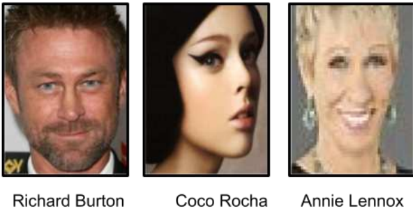
Figure 3. Some of the examples from the extended DFW dataset in which the query returned impostor images.

It is interesting to note that the network’s performance increased considerably, after the downloaded data was used along with the DFW data. No cleaning of the data was performed and the search engine’s results were used to assign the identity to the downloaded images. We noted that in a few cases, images retrieved against the search query generated impostor images too. However, they are used as is in the training without any manual pruning. Some examples of the above mentioned weakly labelled images (which do not belong to the correct identity) are shown in Figure 3. We refer to this data as weakly labelled as it is possible that an incorrect identity retrieved during the web search can be due to an attribute of the face in the retrieved image, which makes the image as a good candidate for being the disguised representation of the original identity.