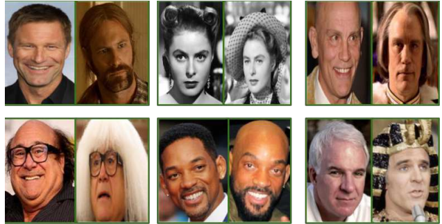
Figure 5. The Figure shows eg. of True Negative i.e. both the images in each of the six pairs are of the same identity (the one on the left is a genuine image and the one on the right is a disguised image), but our model says that the two images are that of an imposter images.