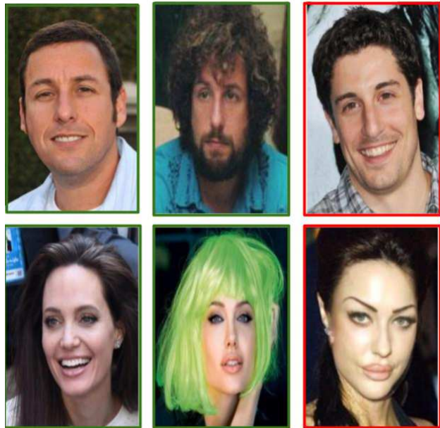
Figure 1. The Figure shows examples of disguised and impostors in the DFW database [13]. The first column is a genuine image of a celebrity, the second column is the same person in a disguise and the third columns shows the images of impostors who look like the celebrities in column one. Green bounding box signifies a same identity and red signifies an impostor.

There has been some work on face verification of disguised faces in different imaging modalities like thermal and visual medias [11, 7] in which they exploit both the modalities to get the best of both worlds, but the problem of “disguise” in a single modality has not been explored in detail. The problem of disguise deals with determining whether the given pair of images are of the same person in disguise or of different persons (one of them being the impostor). The Figure 1, clearly show examples of disguised people and impostors.