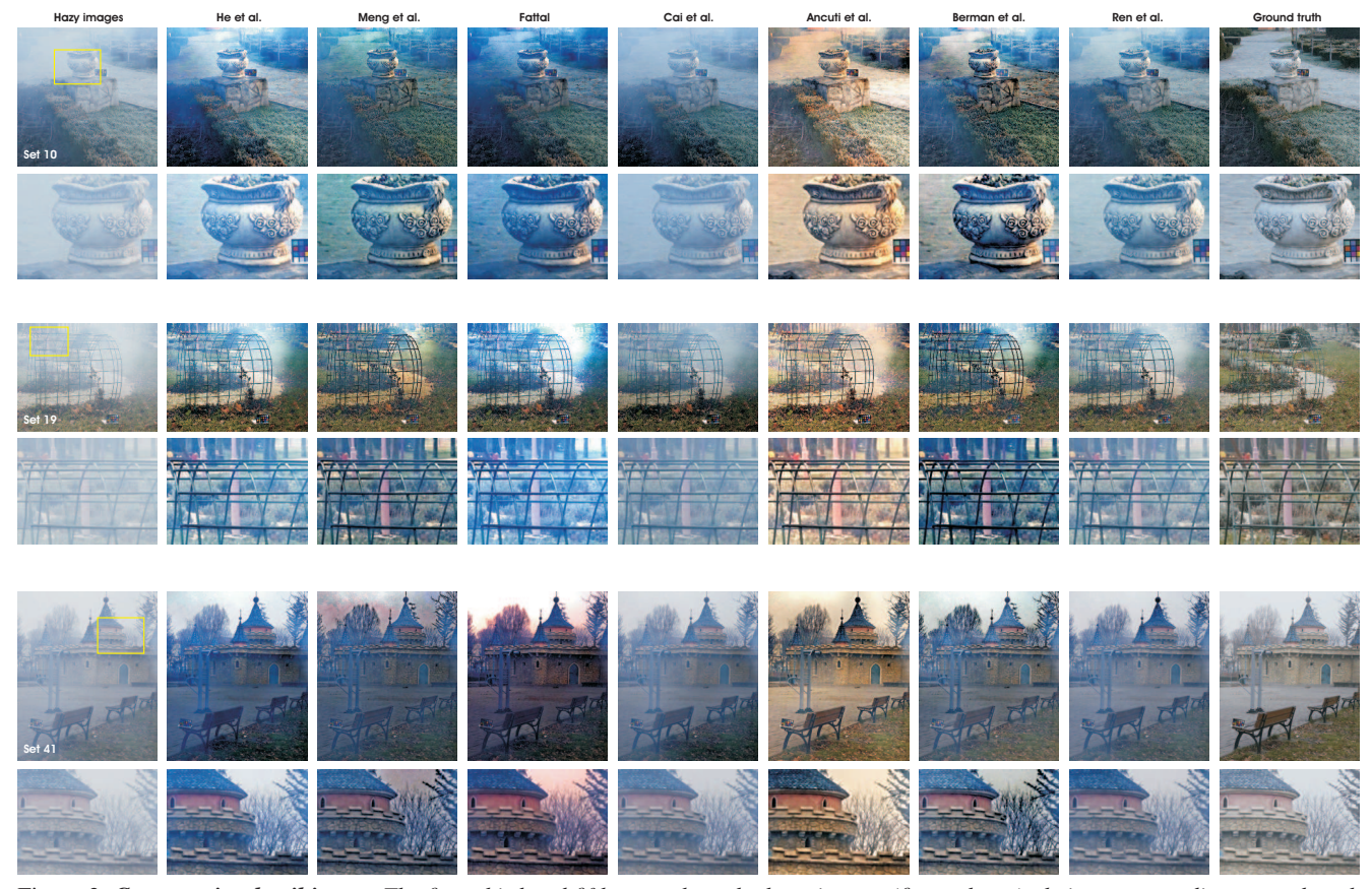
Figure 3. Comparative detail insets. The first, third and fifth rows show the hazy images (first column), their corresponding ground truth (last column), and the results of several dehazing techniques [20, 28, 16, 8, 3, 7, 34], for the scenes 10, 19, and 41, respectively. The corresponding detail insets are shown below in the even rows.

index (SSIM) compares local patterns of pixel intensities that have been normalized for luminance and contrast. The SSIM ranges in [-1,1], with maximum value 1 for two identical images. In addition, to evaluate the level of color restoration, we compute the CIEDE2000 [38, 45]. CIEDE2000 measures accurately the color difference between two images and generates values in the range [0,100], with smaller values indicating better color preservation. In addition to Table 1, Table 4 presents the average SSIM, PSNR and CIEDE values over the entire 45 scenes of the O-HAZE dataset. From these tables, we can conclude that in terms of structure and color restoration the methods of Meng et al. [28], Berman et al. [7], Ancuti et al. [3] and Ren et al. [34] perform the best in average when considering the SSIM, PSNR and CIEDE indices. A second group of methods including He et al. [20], Fattal [16] and Cai et al [8], are less competitive both in terms of structure and color restoration.