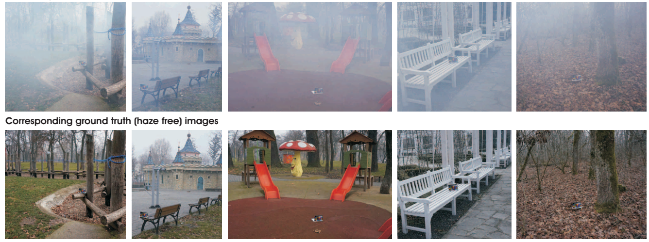
Figure 1. O-HAZE dataset provides 45 pairs of hazy and corresponding haze-free, i.e. groundtruth, outdoor images.

haze-free images for 45 various outdoor scenes. Haze has been generated with a professional haze machine that imitates with high fidelity real hazy conditions. Another contribution of this paper is a comprehensive evaluation of several state-of-the-art single image dehazing methods. Interestingly, our work reveals that many of the existing dehazing techniques are not able to accurately reconstruct the original image from its hazy version. This observation is founded on SSIM [43] and CIEDE2000 [38] objective image quality metrics, computed using the known reference and the dehazed results produced by different dehazing techniques. This observation, combined with the release of our dataset, should certainly motivate the design of improved dehazing methods.