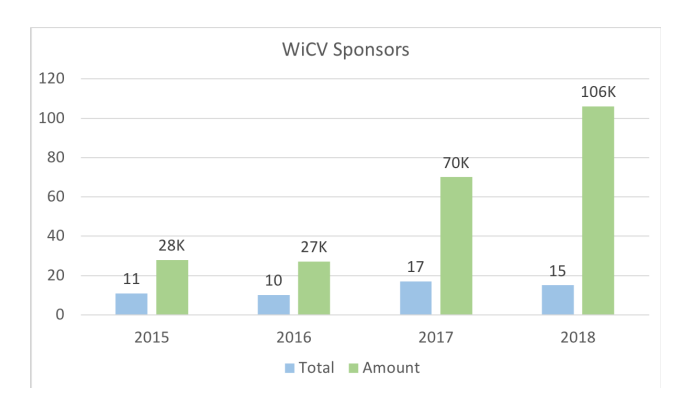
Figure 2: WiCV Sponsors. The progression of number of sponsors and the amount of sponsorships for WiCV.

This year we had 72 high quality submissions from a diverse range of topics and institutions. The most popular topics were object recognition and detection, applications of computer vision, and machine learning approaches. There were also very interesting research applications ranging from underwater and telescope imaging to detection of animals in the wild. Over all submissions, 8% were selected to be presented as oral talks, 20.8% were selected to be included in the proceedings, and 68% were selected to be pre-