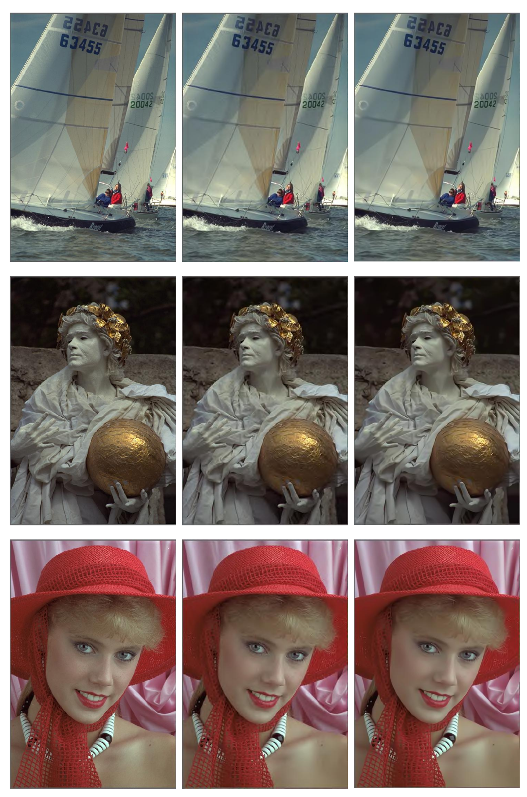
(a) Original image