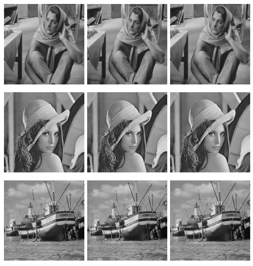
(a) Original image