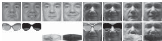
Figure 3. Top row: example indoor face images (first 4) and outdoor face images (last 4) cropped from the FRGC database. Bottom row: some sunglasses and masks used in the experiments, and some example face images with synthesized occlusions.

6,360 are controlled images and 6,416 are uncontrolled images. The testing set consists of 466 individuals, including 16,028 controlled images captured indoor and 8,014 uncontrolled images captured outdoor. The testing set contains some individuals present in the training set, but there is no overlapping of images between the two sets. The top row of Fig. 4 shows some cropped face images from the database.