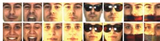
Figure 4. Example images cropped from the AR database, under expressions, illumination variations, occlusions with sunglasses and scarf.

The AR database is a color facial database which contains more than 3,000 face images corresponding to 135 individuals (76 men and 59 women). These images are captured in two sessions, separated by two weeks (14 days). In each session, frontal face images under four different scenarios have been taken for each individual. Particularly, there are four face images for different facial expressions under normal light, three images under different illumination conditions with normal expression, three images under sunglasses occlusion and another three images under scarf occlusion. Images under the same conditions have been taken in both sessions so that there are 26 images per subject. There are also some people who just participated in one session. Fig.4 shows some examples from the AR database.