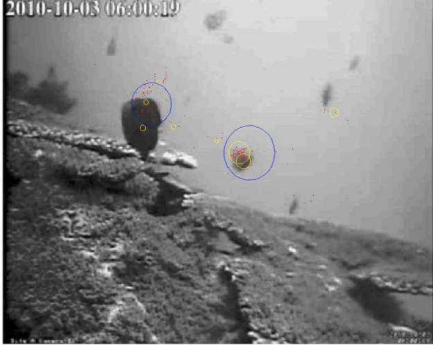
Figure 2. Clustering applied on the acquired data: Red dots are the locations clicked by the users. Yellow circles represent the result of the first clustering iteration, while the blue circles are the final result of the clustering method. The radius of each circle is equal to the sum of the quality scores of the users that made an annotation that belongs to that cluster, given by (3).

At each iteration, every cluster c is assigned a value that represents its significance, or radius, and is given by: