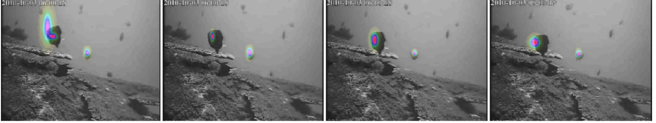
Figure 3. Heatmaps of two fish detected in an 4-frame sequence.