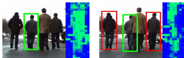
Figure 1. The proposed method can track a target person (green box) during partial occlusion and in the presence of distractors (red boxes). It weights the “reliability” of the weak classifiers within the box (green means high weight; blue means low weight). In the left image, the person is unoccluded; therefore, high weights are associated with weak classifiers that cover the body. In the right image, the person is partially occluded; consequently, “reliability” weights for the occluded portion decrease while weights for the unoccluded portion are reinforced. Thus, the ensemble tracker can distinguish the tracked person from the distractors.

First, the common assumption that the observed data, examples and their labels, have an unknown but fixed joint dis-