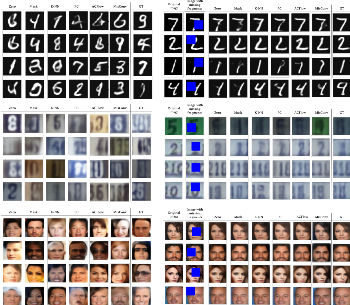
Figure 2: Samples (right) and reconstructions (left) produced by WAE models.

model trained on complete images. It means that MisConv is capable of producing images of similar quality to standard WAE. While ACFlow performs very well on MNIST, its performance drops significantly on other datasets. PC, our main baseline, again gives unsatisfactory results. For the illustration, we present sample images generated by WAE models, see Figure 2 (left).