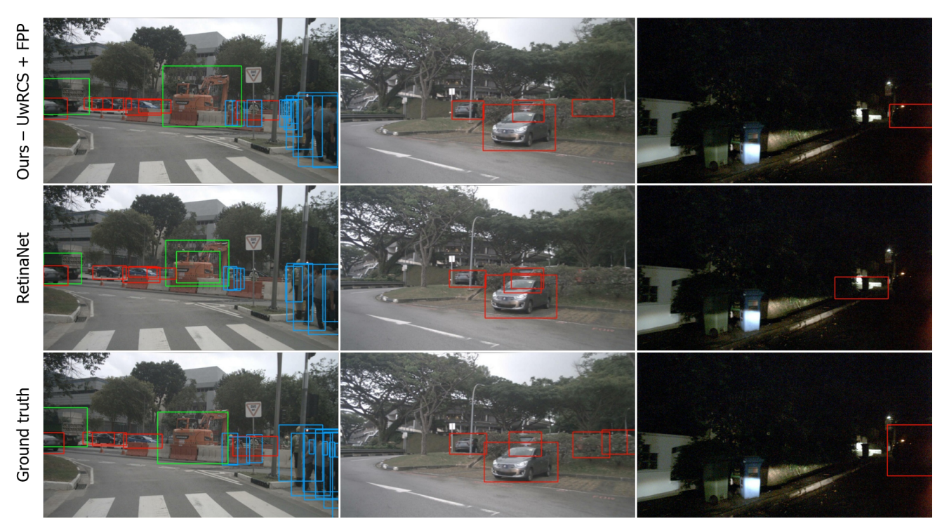
Figure 3. Qualitative comparison of detection results. Red: Car, Green: Truck, Blue: Pedestrian.

should be noted that the mAP and wmAP of all methods are in a relatively close range. The best mAP is 3.85 above the lowest, which is a relative increase of 11.7%, while the relative increase in terms of the wmAP is even less. We can observe that the Nabati & Qi 2020 [18] model only slightly outperforms its image-only baseline Faster R-CNN, while the CRF-Net [19] does not outperform its image-only baseline RetinaNet [15] in our evaluation. From our own experiments, we find that this is due to the many fusion points in the CRF-Net architecture, which can lead to a suboptimal detection performance.