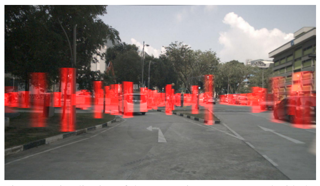
Figure 1. Visualization of the camera image, augmented with the uncertainty weighted RCS channel values highlighted in red.

One of the main challenges of radar-camera fusion is to handle the heterogeneity of the data sources. While the camera provides raw sensor information in the form of RGB images, the radar typically provides a pre-processed list of detections, containing measurements of the distance, rela-