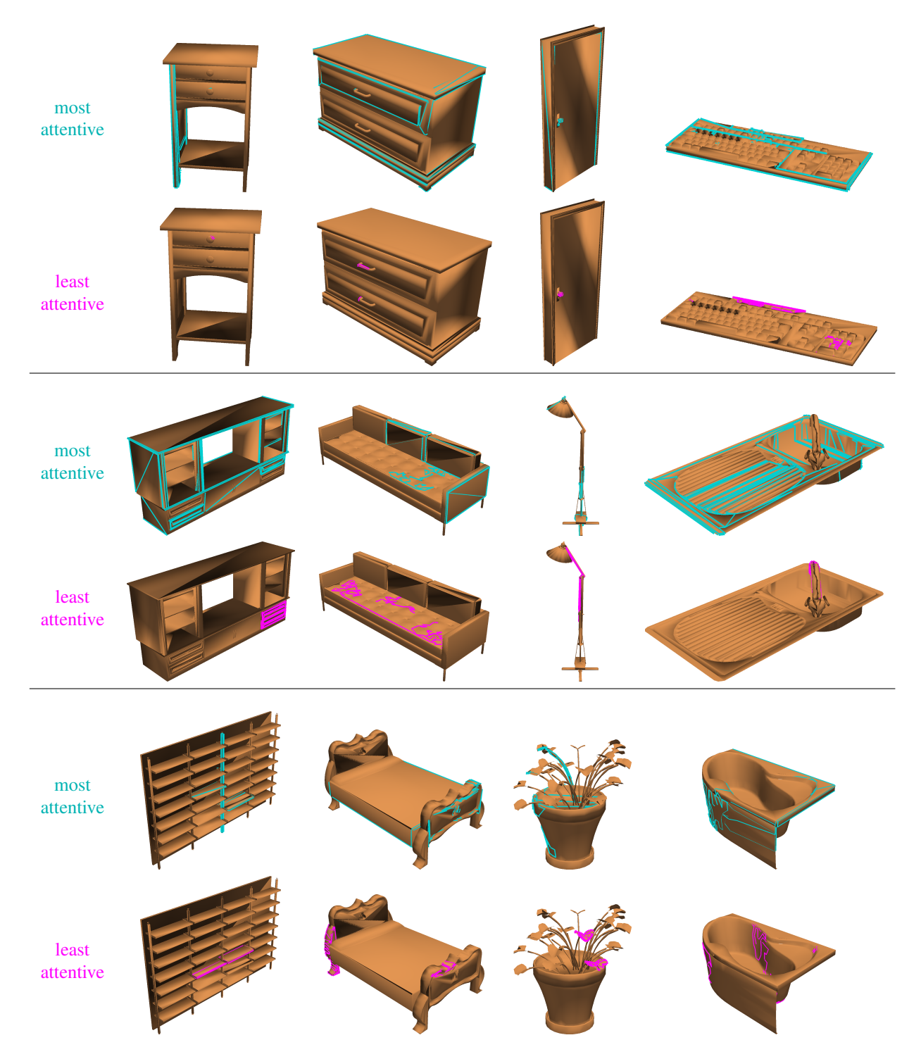
Figure 2: The most (in cyan) & the least (in magenta) attentive walks of various meshes